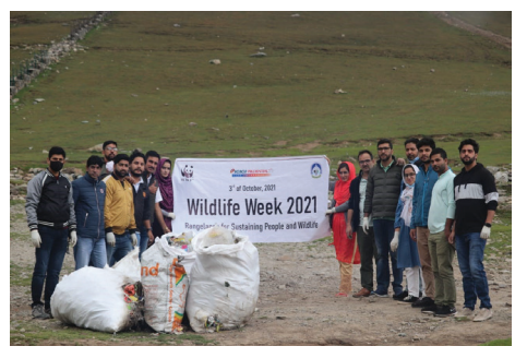
Cleanliness Drive organized by BGSBU at Peer Ki Gali

So to Protect our community, ecosystem and then balance the approaches of Environment and man, man must have to opt such doctrine, discipline, subject, ways and amalgam of provision by heart, which will guide him towards sustainable goal and that is Environmental sciences. It is obligation on all us ,to follow it's disciplines and assessments of approaching